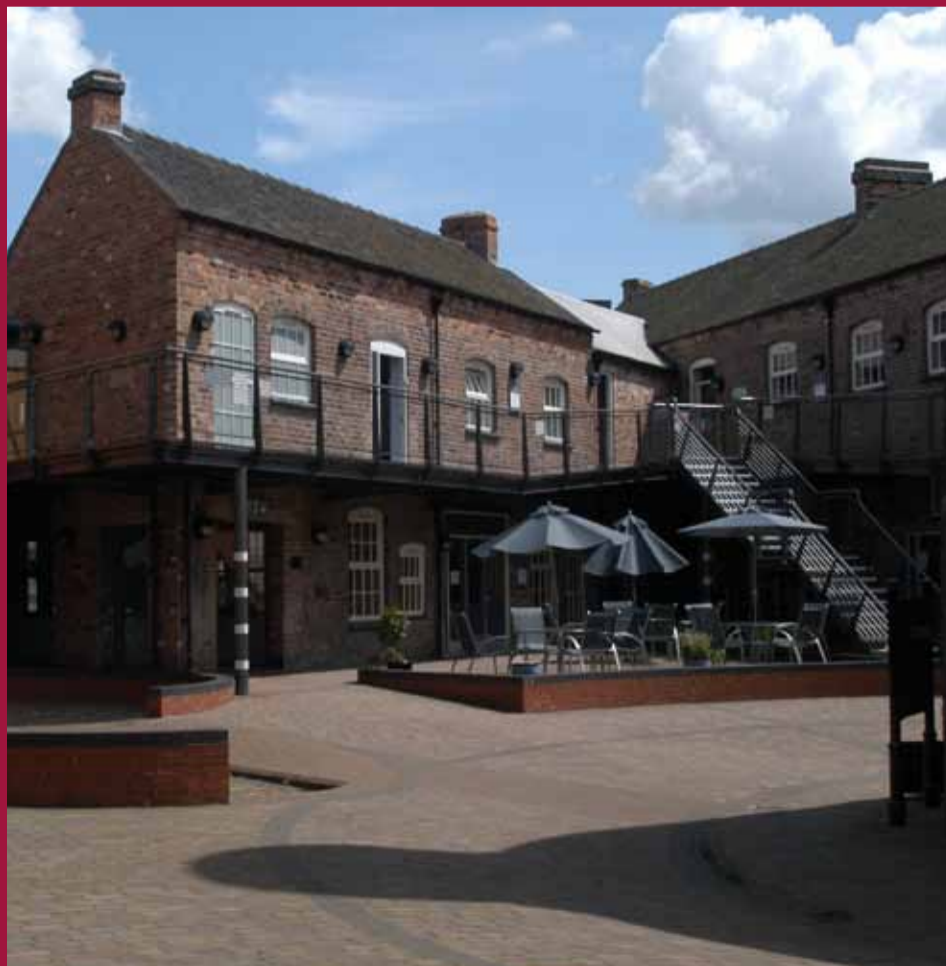
Dudson Centre, City Centre