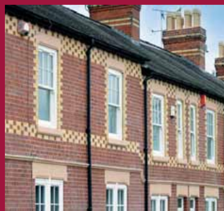
Terraced housing, Knutton