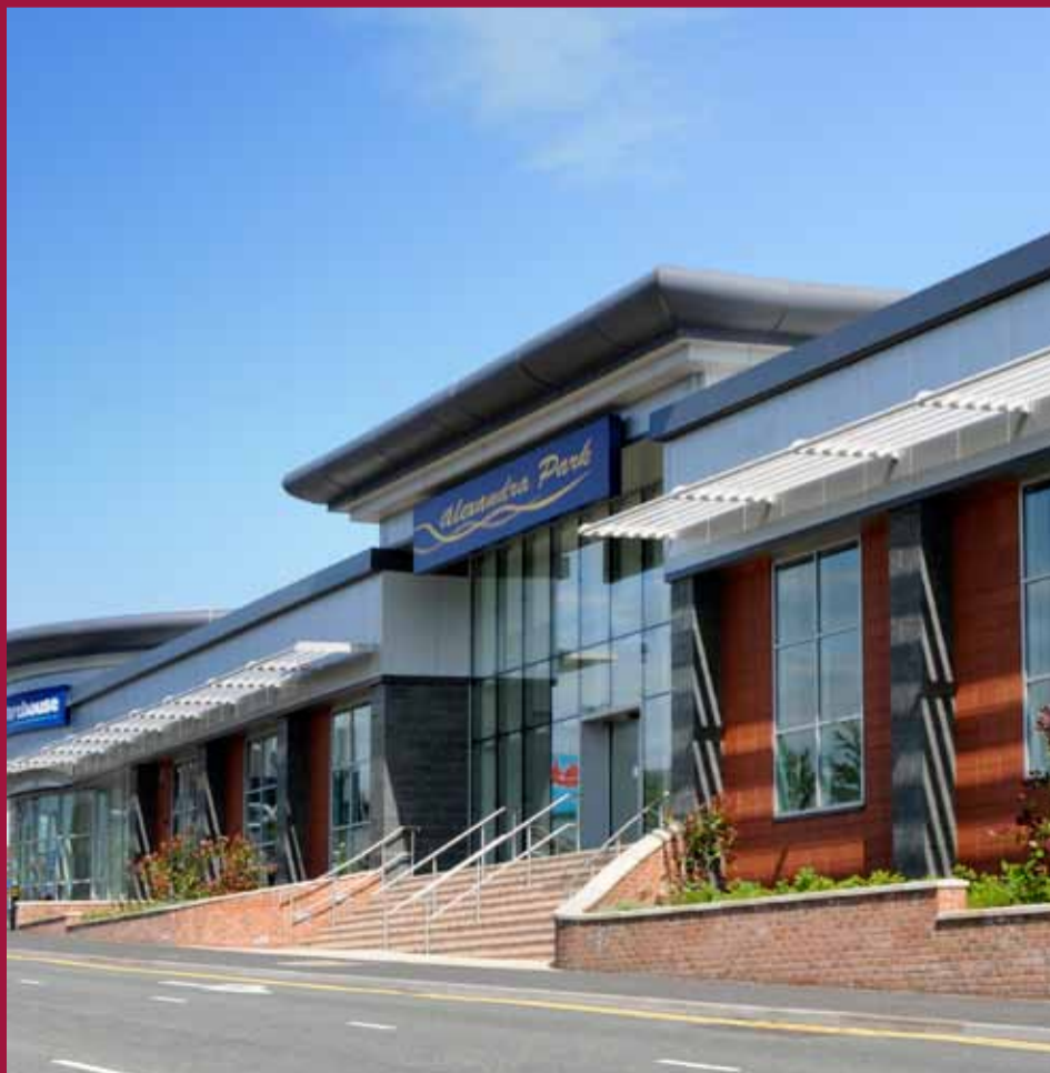
Scotia Road, Tunstall

By following these established urban design principles we can succeed in making Newcastle-under-Lyme and Stoke-on-Trent places with a sense of civic pride that provide a high quality environment for living and working in.