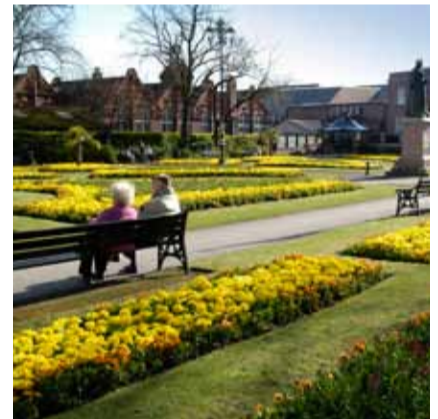
Queen's Gardens, Newcastle

The design guide has been designed as an electronic document, which is intended to be read on a computer screen, using a CD ROM. The aim is to make the document fully interactive so that is possible to easily find your way to any one section and related references, by clicking on a link.