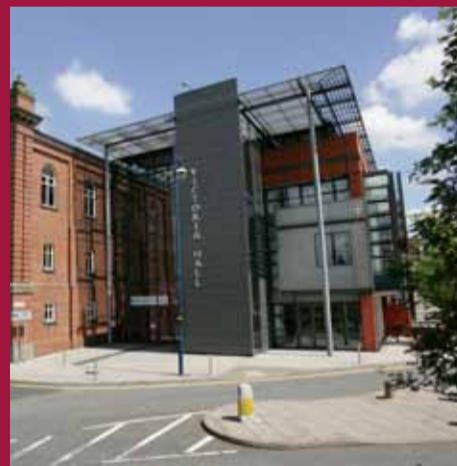
Victoria Hall, City Centre