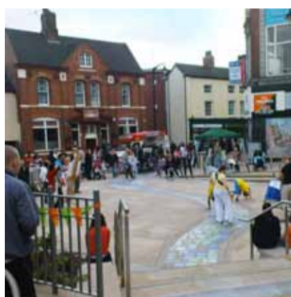
Swan Square, Burslem

The planned growth for Newcastle-under-Lyme and Stoke-on-Trent will see 20,000 homes, 332 hectares of new employment land, and 155,000 square metres of retail floorspace being provided over the plan period together with a wide range of supporting community infrastructure.