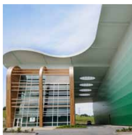
Blue Planet, Chatterley Valley