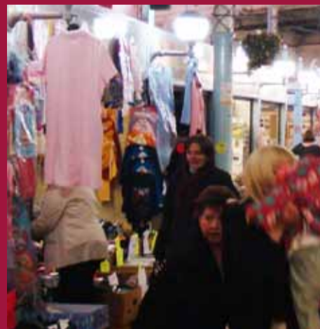
Indoor Market, Longton