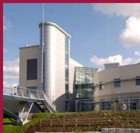
North Staffordshire Hospital Clinical Medical Centre