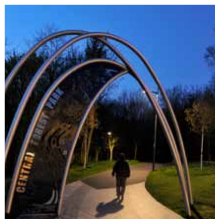
Central Forest Park

The Urban Design Guidance will be a formally adopted Supplementary Planning Document (SPD) covering both local authority areas, and will form part of the Local Development Framework in both areas. It will become an important material consideration in determining all future planning proposals.