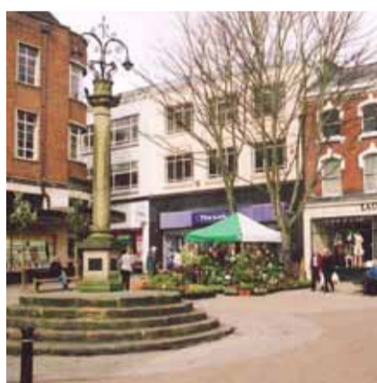
High Street, Newcastle

With this level of physical change it will be vital to ensure that we create a pattern of development sensitive to local distinctiveness rather than providing a standard approach across the conurbation. The production of Urban Design Guidance will provide the basis for a more comprehensive and effective approach to achieving design quality.